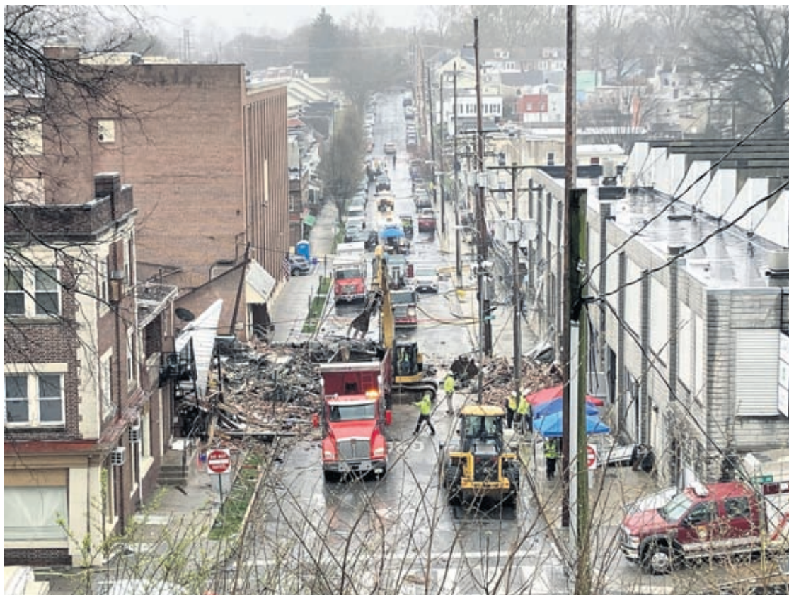
Emergency responders and heavy equipment are seen at the site of a deadly explosion at a chocolate factory in West Reading, Pennsylvania, Saturday, March 25.